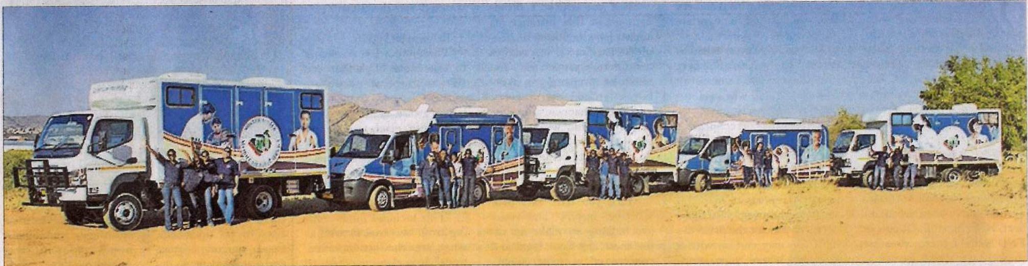
The Mister Sister program, which uses mobile clinics to provide primary healthcare services to both remote and underserved people, has won the World Bank's Public Private Partnership Short Stories Competition. According to a panel of public-private partnership experts, this programme is "a unique PPP arrangement that leverages both governmental and private sector resources to cover the cost of service delivery and has played a vital role in upgrading health infrastructure and the quality of services delivered to rural populations in Namibia." Mister Sister is run by PharmAccess Namibia and is funded by the Heineken Africa Foundation.