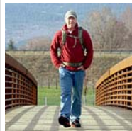
Father's Memorial Trek Ends in Second Tragedy